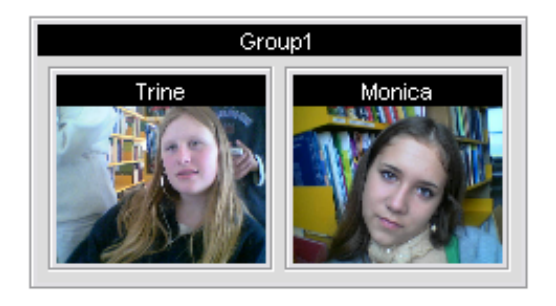
Figure 9: Trine and Monica have formed a group by dragging their eBag icons close together.